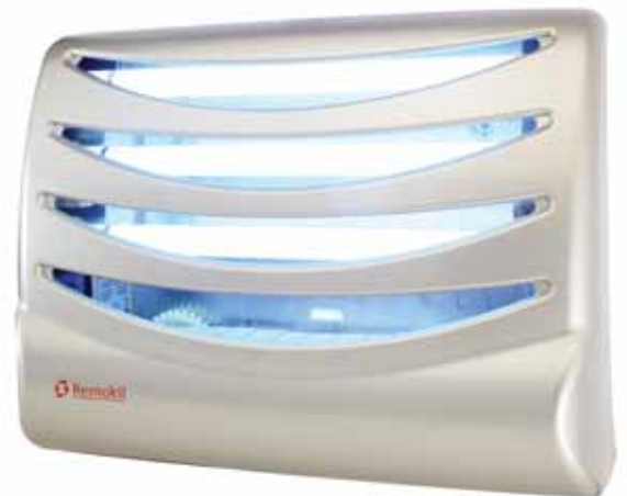
Luminos 3 Plus